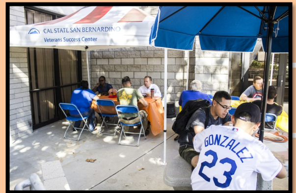
Students eating Thanksgiving lunch while enjoying the fresh air and cool weather.