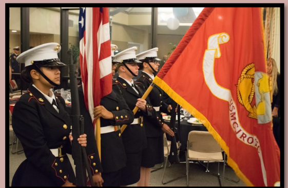
Right: Fontana High MCIJROTC present the colors.