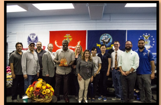
VSC staff and student veterans enjoying Thanksgiving at the Veterans Success Center