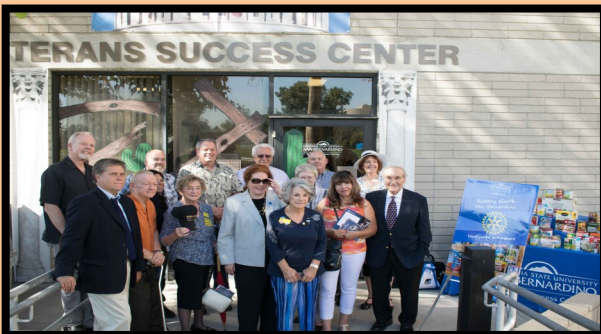
Rotary North San Bernardino members pose proudly near their donations.